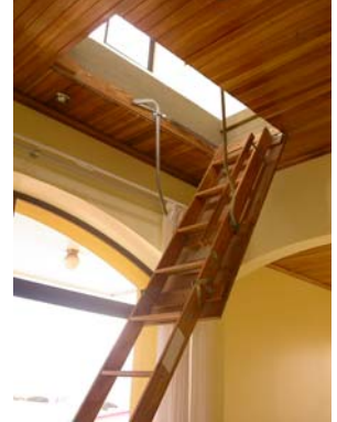
to the third floor look-out