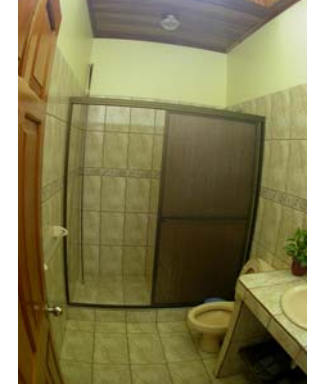
bedroom and bathroom