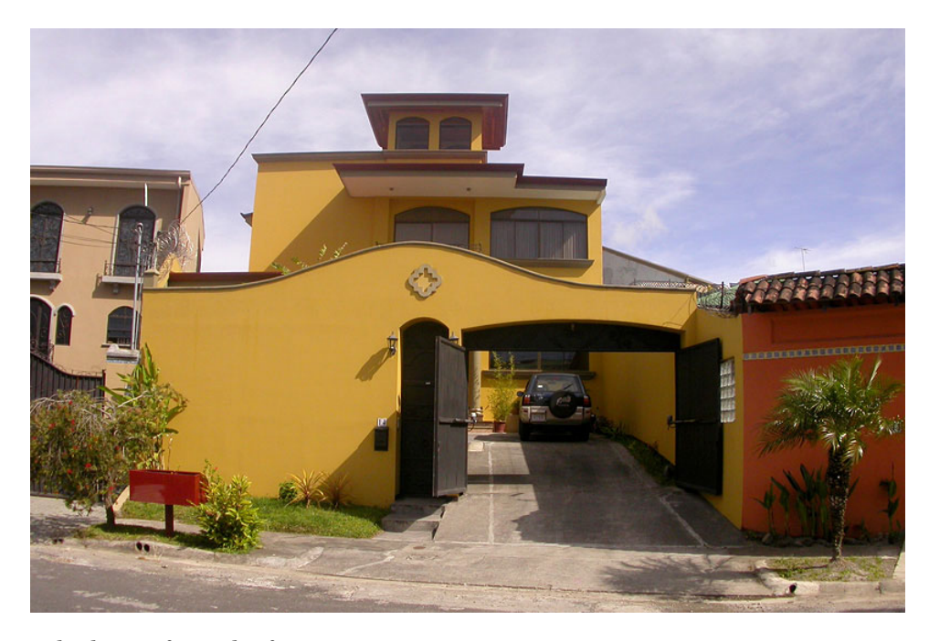
Looking the house from the front.