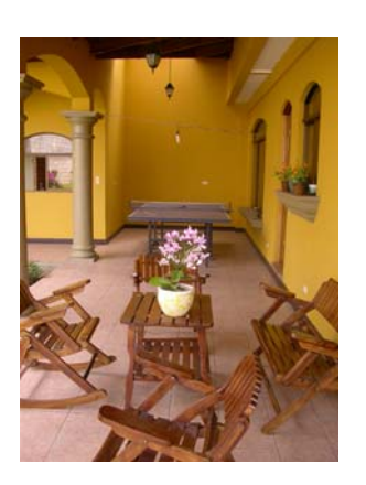
terrace and patio/backyard